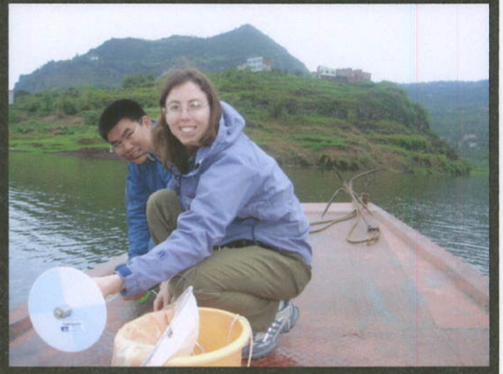
Scenic vistas in the Three Gorges area